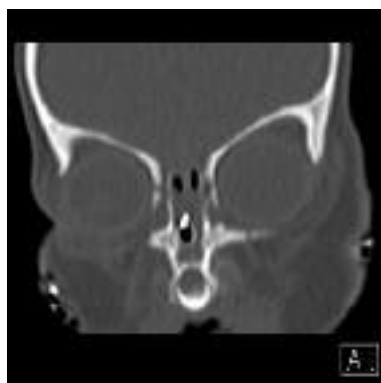
Figure 2B: Coronal CT scan of same patient showing single incisor associated with congenital piriform aperture stenosis.

management during delivery and the appropriateness of an ex-utero intra-partum therapy (ExIT) procedure.