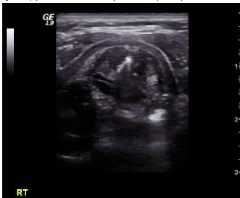
Figure 6: Laryngeal ultrasound of a child with a right vocal fold paralysis. The right vocal fold is abducted.

Contrast swallow is a useful dynamic study but it involves ionising radiation. It can aid in the diagnosis of aspiration, laryngeal cleft, tracheomalacia and tracheo-oesophageal fistula. While pH studies are the investigation of choice for the definitive diagnosis of gastro-oesophageal reflux, contrast swallow examinations can demonstrate reflux into the oesophagus if it occurs during the study although in itself, the contrast swallow is a poor test for detecting reflux. Extrinsic compression from vascular