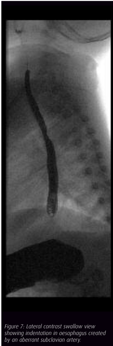
Figure 7: Lateral contrast swallow view showing indentation in oesophagus created by an aberrant subclavian artery.