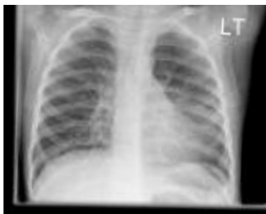
Figure 4: Plain radiograph showing the 'steeples' sign in acute laryngotracheobronchitis.

the airway with either flexible or rigid endoscopy. However, radiology provides a useful adjunct to this and can give invaluable additional information during both diagnosis and follow-up which aids the appropriate management of the patient.