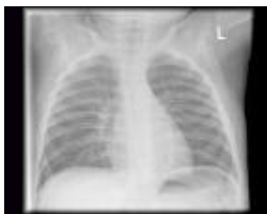
Figure 5: Inspiratory and expiratory chest radiographs showing air-trapping in the left lung on expiratory film.

Plain film imaging of the child with acute stridor has fallen out of favour because it is considered dangerous, especially out of hours, to take a child with a marginal airway away from the resuscitation room and into an environment which the child may find intimidating. The diagnosis of the child with acute stridor is primarily a clinical one. Acute epiglottitis in children has largely been eradicated in this country courtesy of the HIB vaccination programme but it remains a cause of stridor and odynophagia in adults. Acute epiglottitis is primarily a clinical diagnosis and requires prompt treatment. Plain radiography can aid the clinical diagnosis of acute laryngo-tracheo-bronchitis / 'croup' demonstrating the characteristic 'steeples', 'pencil tip' or 'wine-bottle' sign caused by narrowing of the subglottic airway on frontal views. Additional features include loss of soft tissue distinction in the glottic region on lateral films, ill-defined haziness at the soft tissue – air interfaces between