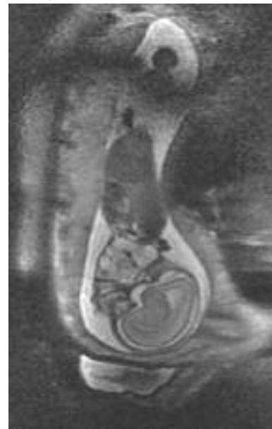
Figure 1: Sagittal T2 weighted foetal MRI image showing mass in the anterior neck.

Where a mass lesion is detected in the neck, foetal MRI can be used to further define the mass, contributing to the differential diagnosis as well as defining its relationship to the airway (Figure 1). This aids the obstetrician and the paediatric airway surgeon in counselling the prospective parents particularly with respect to airway