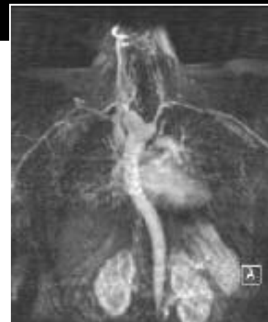
Figure 9: Three-dimensional MIP (maximum intensity projection) post-contrast MRI volume image of the thorax showing double aortic arch.

All children with significant stridor should undergo cross sectional imaging with CT or MRI under general anaesthesia